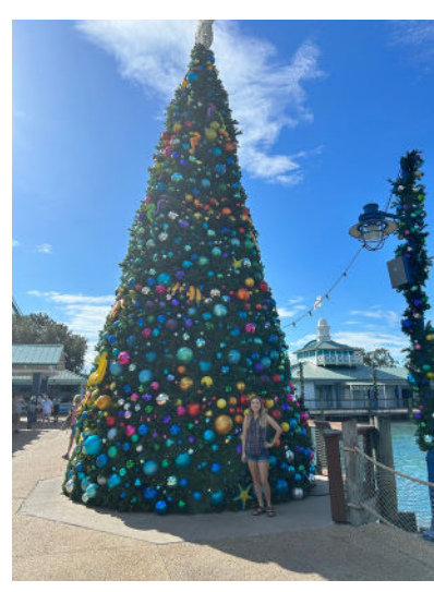
Orlando in December

Want to join my financial support team? Visit: www.ncem.ca/donate/ OR contact us: