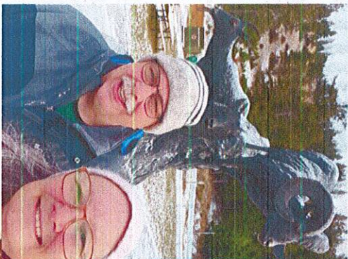
At Radium Hot Springs