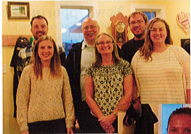
The Family at Walter's 60th. A very blessed man!